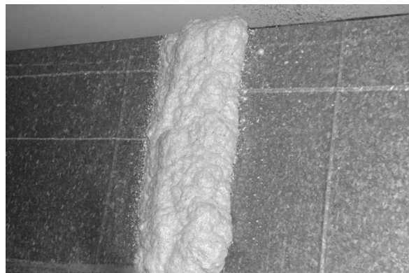
FIGURE 1—DUCT JOINT SEALING

1 R-values are based on tested k-values at 2-inch thickness.