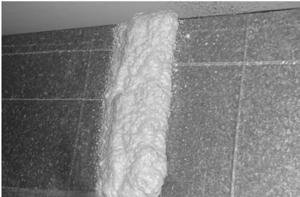
FIGURE 1—DUCT JOINT SEALING

1 R-values are based on tested k-values at 2-inch thickness.